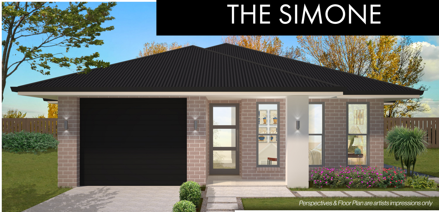
Perspectives & Floor Plan are artists impressions only