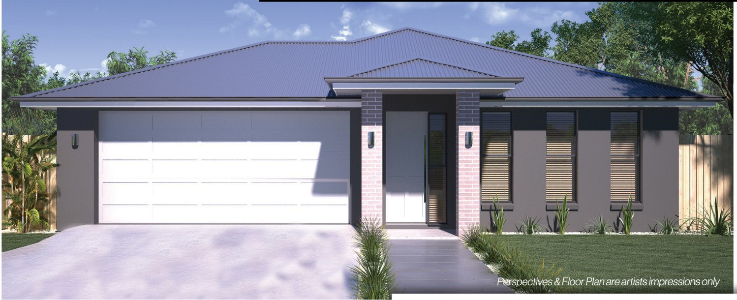
Perspectives & Floor Plan are artists impressions only