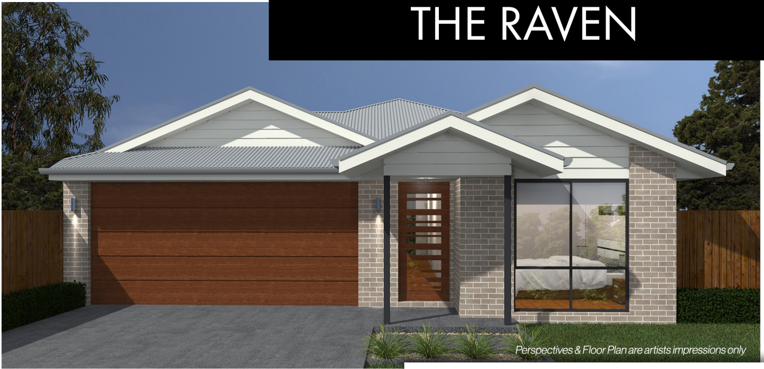
Perspectives & Floor Plan are artists impressions only