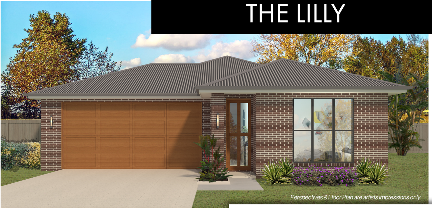
Perspectives & Floor Plan are artists impressions only