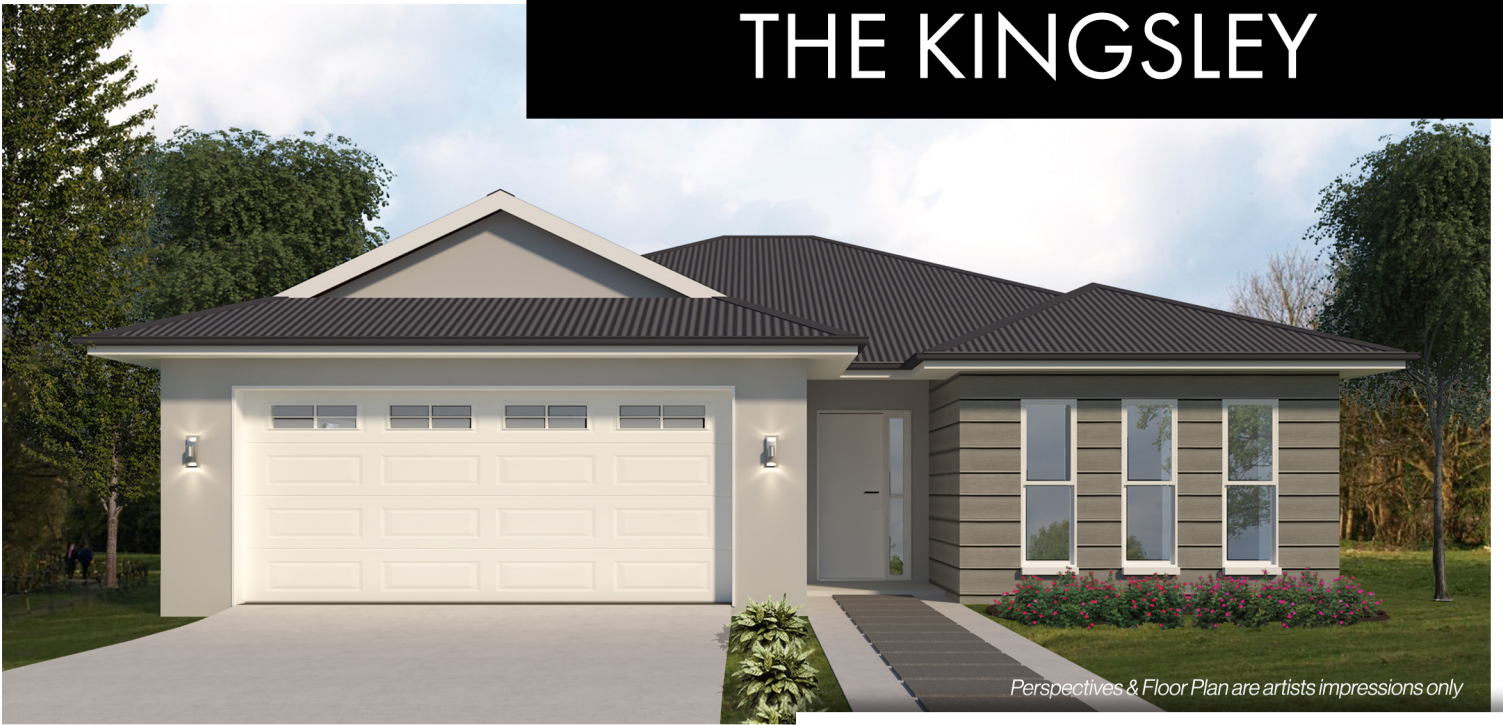
Perspectives & Floor Plan are artists impressions only