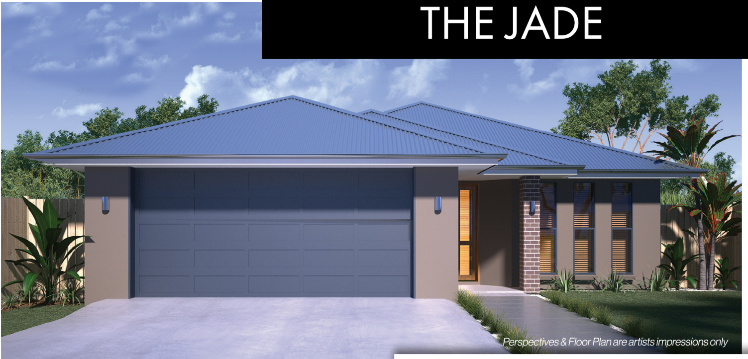
Perspectives & Floor Plan are artists impressions only