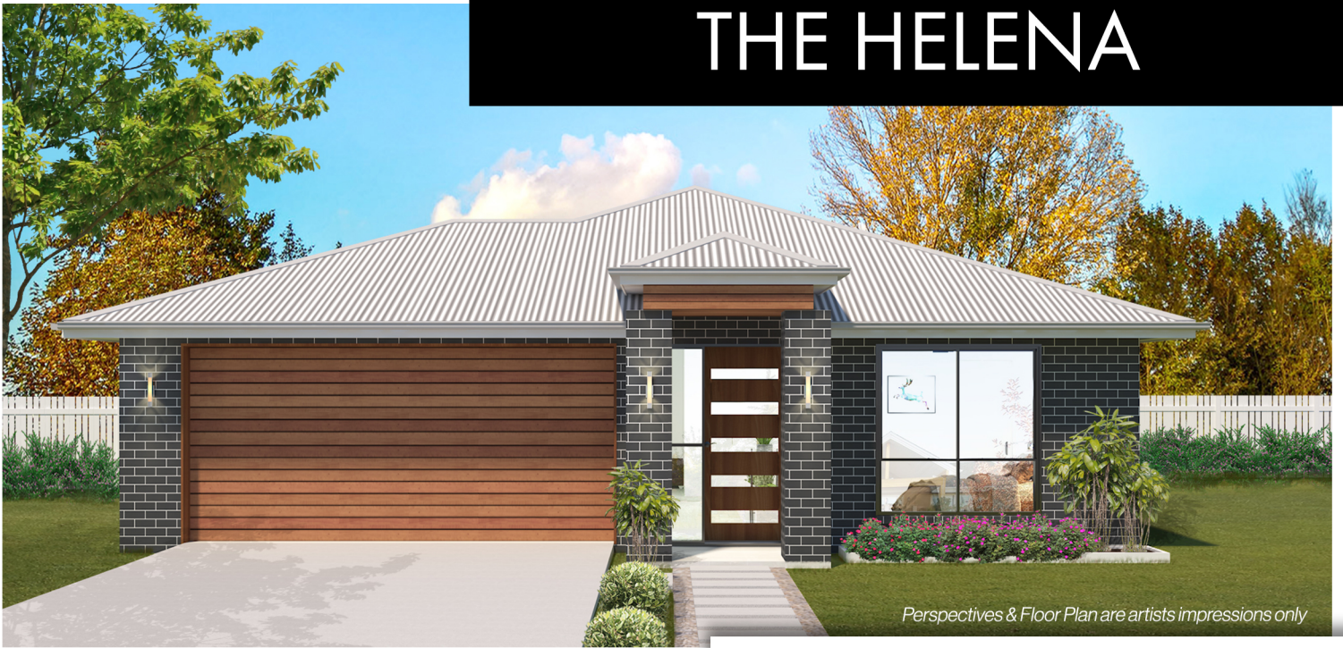
Perspectives & Floor Plan are artists impressions only