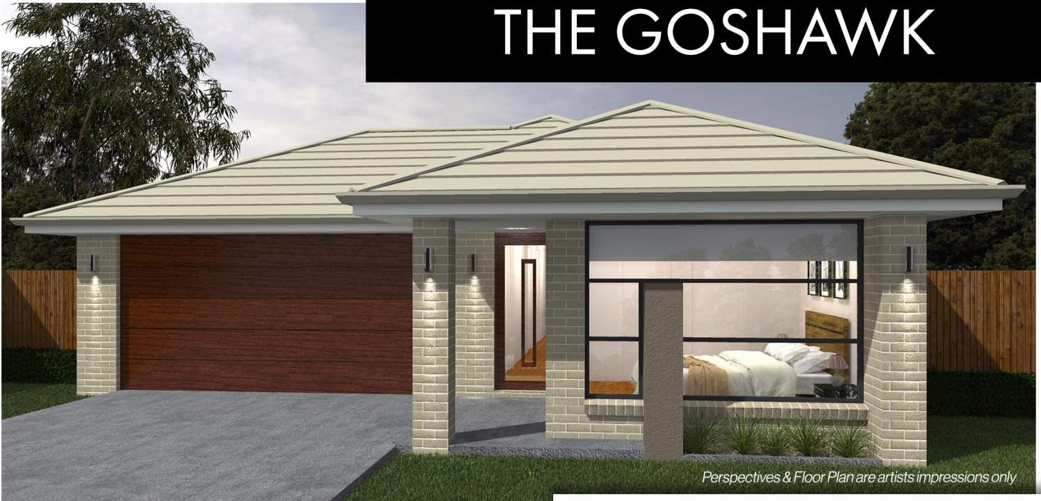
Perspectives & Floor Plan are artists impressions only