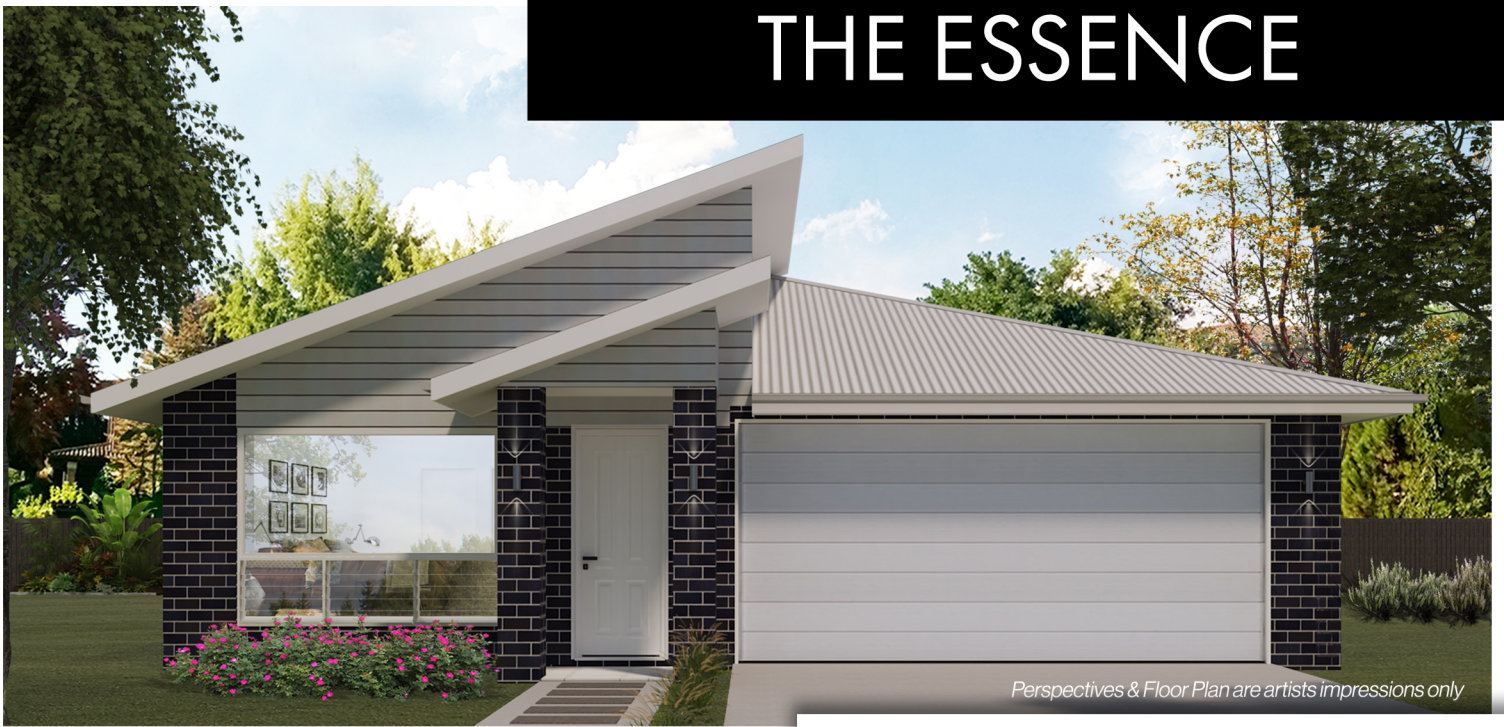
Perspectives & Floor Plan are artists impressions only