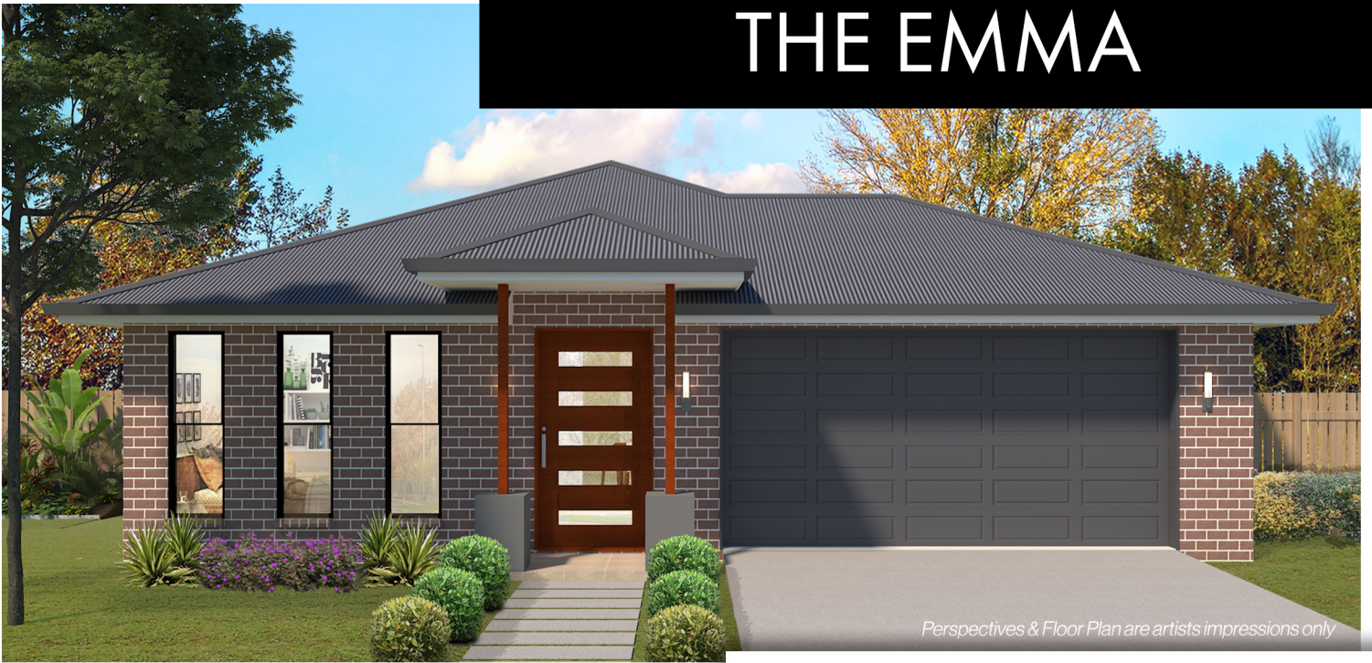
Perspectives & Floor Plan are artists impressions only