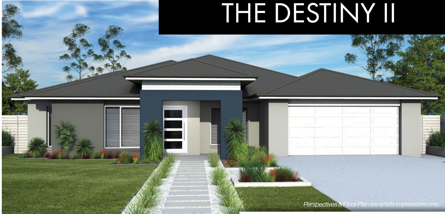
Perspectives & Floor Plan are artists impressions only