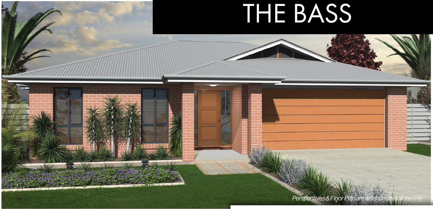
Perspectives & Floor Plan are artists impressions only