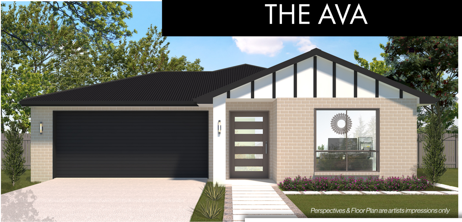
Perspectives & Floor Plan are artists impressions only